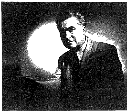
Edgard Varese composer of Ionisation a study in special sounds